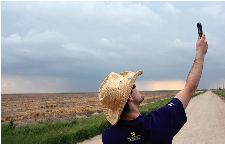
FIG. 2. Taking surface temperature and dewpoint temperature observations near Goodland, Kansas, on 23 May 2010 with a Kestrel 3500 ten minutes before tornado touchdown.

Oklahoma, and observed the preparation and launch of a 0000 UTC OUN radiosonde. Students were also briefed on meteorological research during tours of the NOAA National Severe Storms Laboratory, the NOAA Radar Operations Laboratory, the NOAA Phased-Array Radar, and field visits with scientists participating in the Verification of the Origins of Rotation in Tornadoes Experiment (VORTEX2; Fig. 3). Finally, in 2011, SWIFT students learned about one of the unfortunate consequences of severe convective storms: damage and destruction as a result of the EF-5 tornado in Joplin, Missouri (NWS 2011). After coordinating with the Joplin Fire Department and receiving a formal invitation, the students spent the last day of SWIFT involved in search and rescue efforts. While an unexpected part of SWIFT, that activity significantly impacted their learning experience by solidifying the important societal benefits understanding and accurately forecasting severe convective storms.